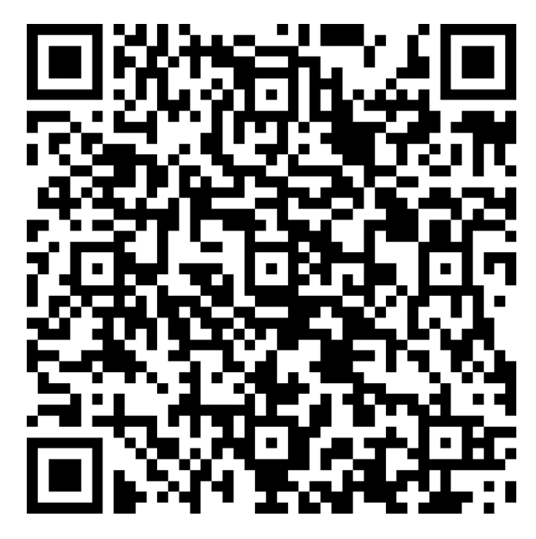
Programs will run

August 1<sup>st</sup> through 4<sup>th</sup> & 8<sup>th</sup> through 11<sup>th</sup> Programs will start at 9 AM and end at 1 PM Transportation will be provided to and from school.